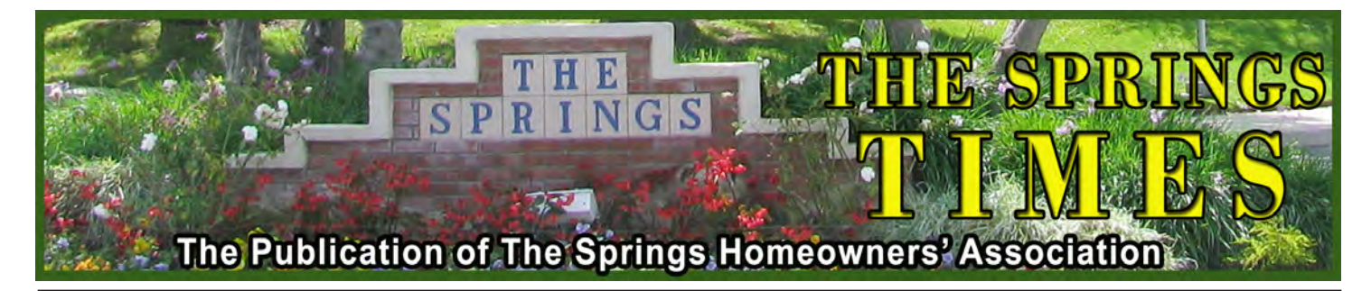
Volume 40, Number 8